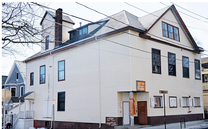
Central Street Studios, 57 Central Street, Somerville

[March 25, 2025--Somerville, MA] Over three-dozen artist and musician tenants at Central Street Studios announce their preservation campaign fundraiser in support of helping to secure their affordable artist workspaces at 57 Central Street in Somerville. The fundraiser is in support of the Arts and Business Council of Greater Boston purchasing the 4-floor property at 57 Central Street, with a mission of keeping it as affordable artist workspaces, with support from the City of Somerville.